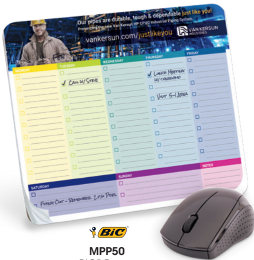
MPP50 BIC® Paper Mouse Pad - 50 Sheets Min. 100, Was $3.54(B) $3.43(B)