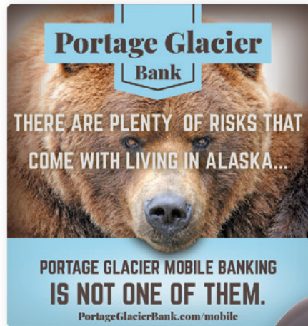
MP6A BIC® 1/8" Fabric Surface Mouse Pad (7-1/2" x 8") Min. 100, Was $3.66(B) $3.55(B)

BIC® Mouse Pad prices include a full color imprint and FREE Set-up.