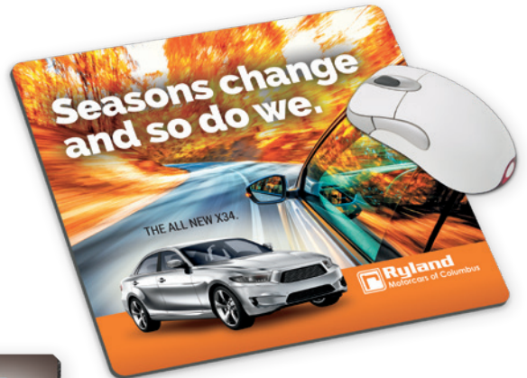
MP1A BIC® 1/8" Fabric Surface Mouse Pad (7-1/2" x 8-1/2") Min. 100, Was $3.71(B) $3.60(B)